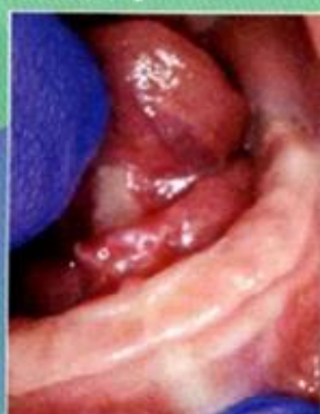
5 Days After (Note: healing coagulum patch)