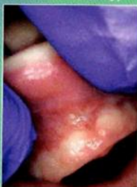
3 Weeks After