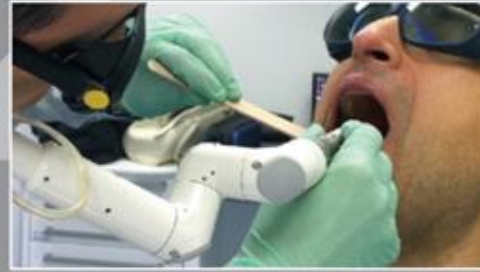
Step 2: TISSUE STRENGTHENING